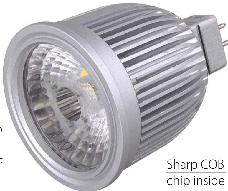
Sharp COB chip inside

This is the perfect lamp for areas where light levels are not critical or where a high quality budget lamp is required.