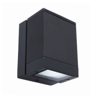
7W Diablo Square Direct CED6240S