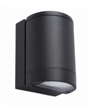
14W Diablo Round Up/Down CED6280R