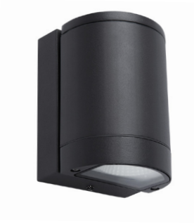
7W Diablo Round Direct CED6240R