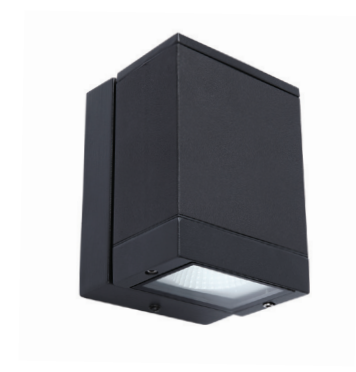
14W Diablo Square Up/Down CED6280S