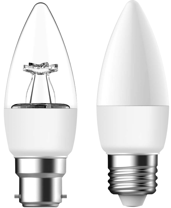
LED Candle Crystal Clear

Decorative lighting, retail display lighting, restaurant and café lighting, domestic home lighting.