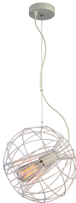
SENTINEL2 (Matt White)